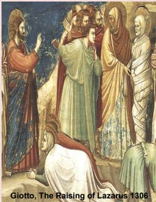
Giotto, The Raising of Lazarus 1306

John even recalls the blind man in his account today (John 11:37). Like the man's birth in blindness, Lazarus' death is used by Jesus to reveal “the glory of God” (John 9:3). And again like last week, Jesus' words and deeds give sight to those who believe (John 11:40). If we believe, we will see that Jesus loves each of us as He loved Lazarus, that He calls us out of death and into new life. By His Resurrection Jesus has fulfilled Ezekiel's promise in today's First Reading. He has opened the graves that we may rise, put His Spirit in us that we may live. This is the Spirit that Paul writes of in today's Epistle. The same Spirit that raised Jesus from the dead will give life to we who were once dead in sin. Faith is the key. If we believe as Martha does in today's Gospel that Jesus is the resurrection and the life even if we die, we will live. “I have promised and I will do it,” the Father assures us in the First Reading. We must trust in His word, as we sing in today's Psalm that with Him is forgiveness and salvation.