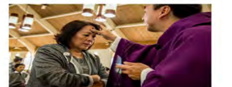
Join our faith community in a transformative Lenten journey through CRS Rice Bowl. Visit crsricebowl.org to learn more.