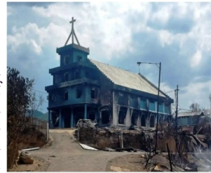
The remains of a burnt church are seen in Langching village some 45 km from Imphal, the capital city of Manipur on May 31. The ongoing ethnic violence has kept India's northeastern state on the edge since May 3.