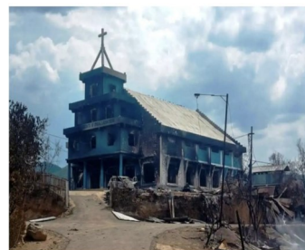
The remains of a burnt church are seen in Langching village some 45 km from Imphal, the capital city of Manipur on May 31. The ongoing ethnic violence has kept India's northeastern state on the edge since May 3.

Congratulations and God's blessings to the graduating Class of 2024!